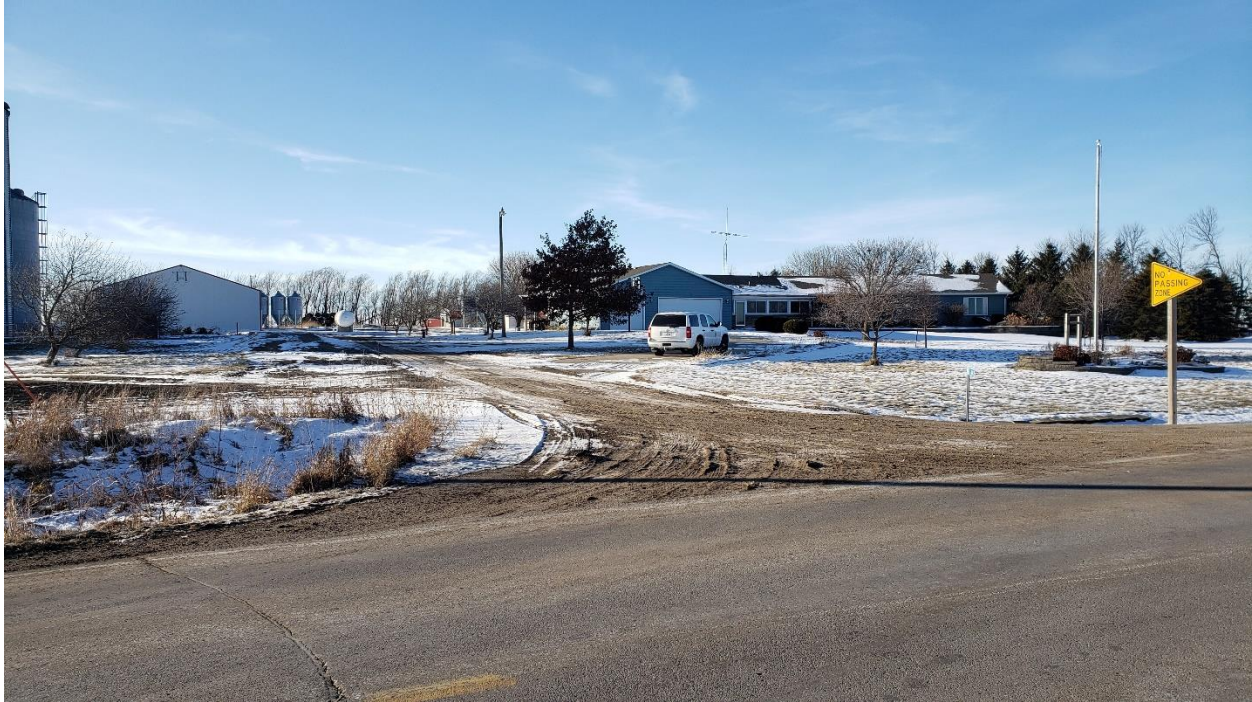
Figure 5 Looking at the existing driveway