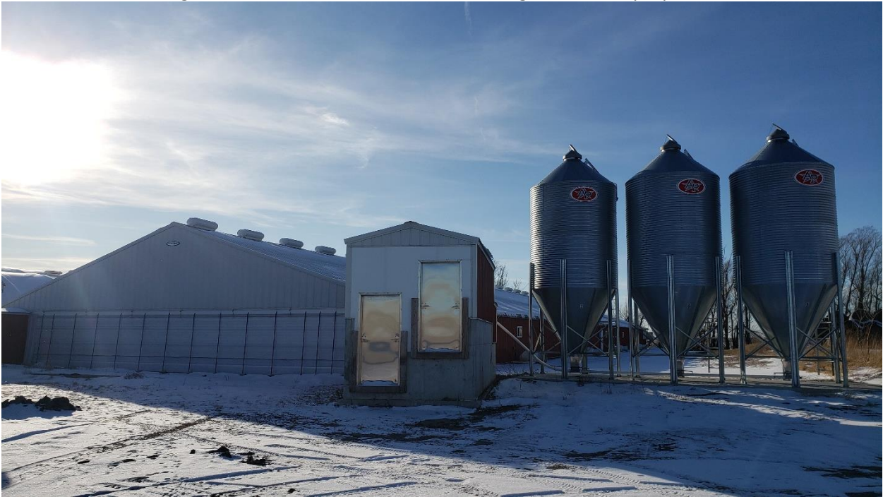
December 18, 2019, J. Robbins

Looking at the first animal confinement building facilities on proposed Lot 1