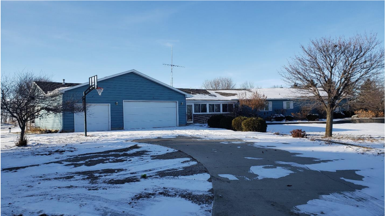
December 18, 2019, J. Robbins

Looking at the existing house on proposed Lot 1