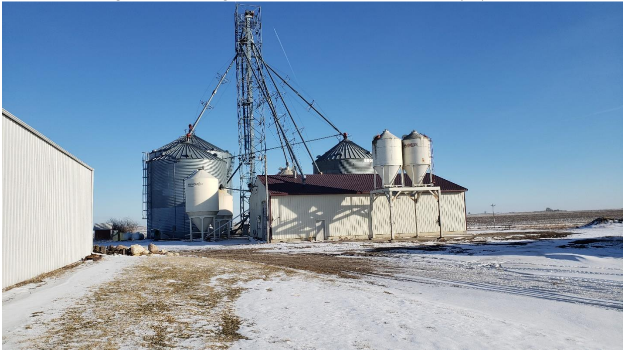
Figure 6 Looking at the feed mill, grain bins, and associated structures on proposed Lot 2