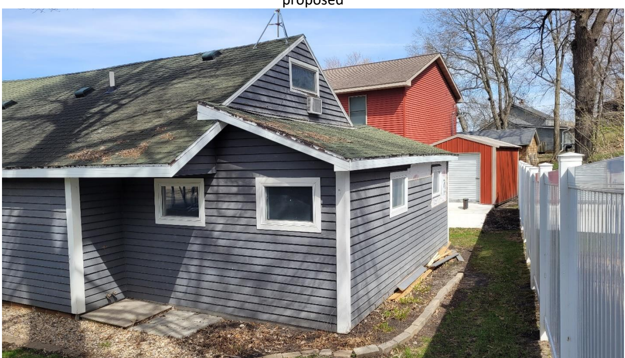
Figure 1 Looking at the portion of the house that the second-story addition and foundation install are proposed