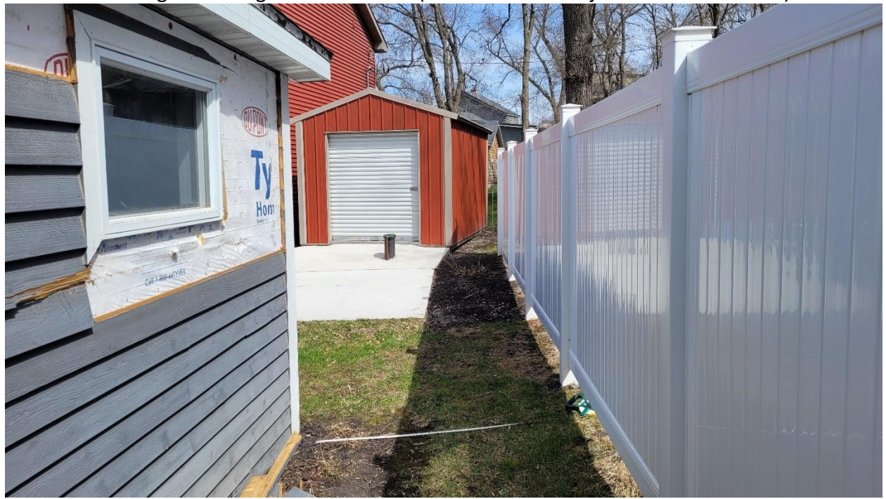
Figure 2 Looking east along the rear lot line (the rear lot line is just behind the fence)