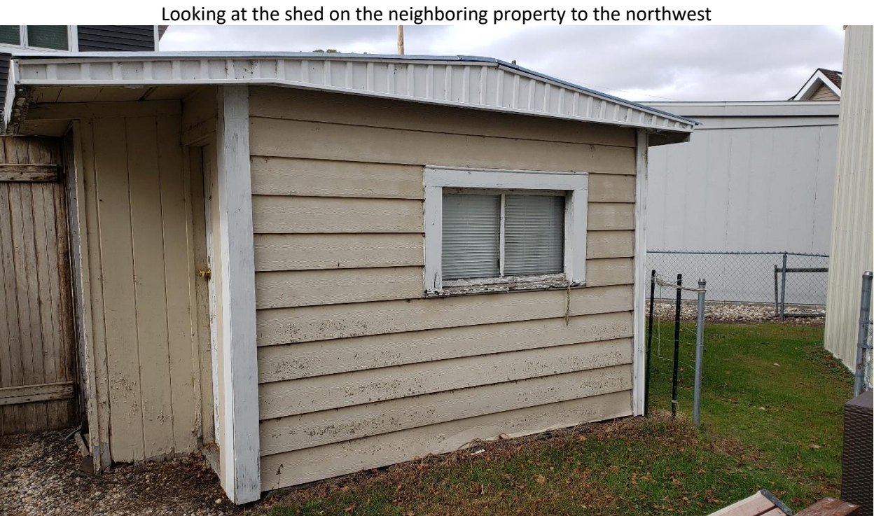
Figure 3 Looking at the shed on the neighboring property to the northwest