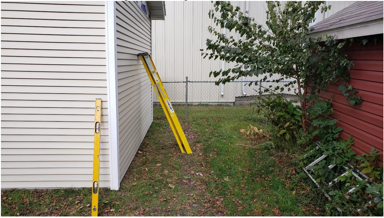
October 16, 2019