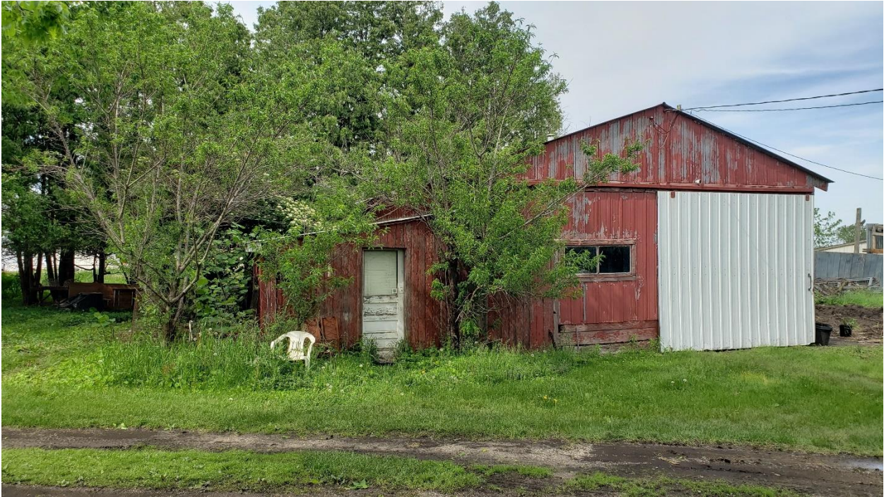
May 28, 2020, J. Robbins

Looking at the existing building (to be removed) where the proposed storage building will be located