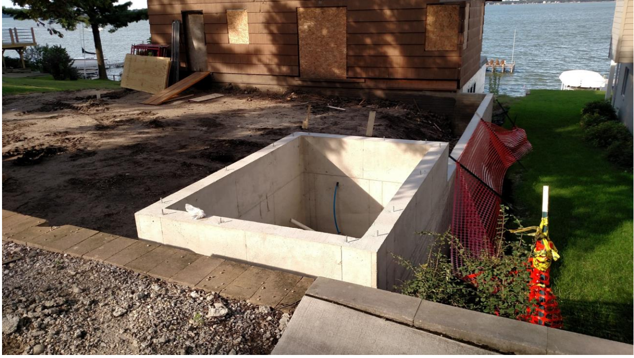
Figure 2 Looking at the constructed footings and foundation for the wellhouse