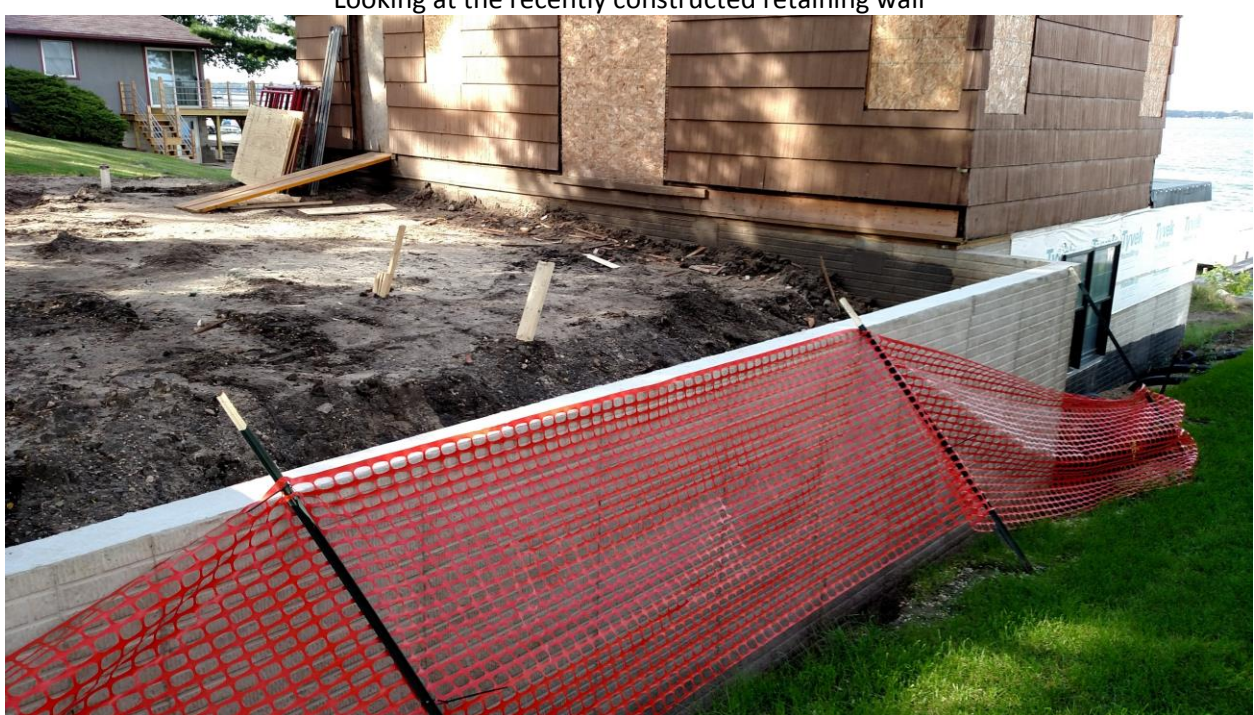
Figure 3 Looking at the recently constructed retaining wall