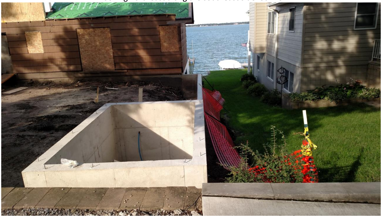
Figure 4 Looking northeast along the southeast side lot line