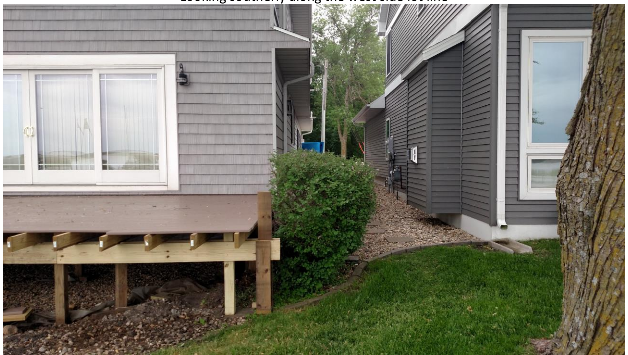
Figure 2 Looking southerly along the west side lot line