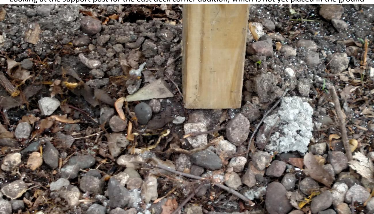
Figure 4 Looking at the support post for the east deck corner addition, which is not yet placed in the ground