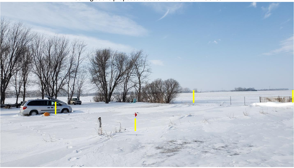
February 3, 2021, J. Robbins

Looking at the proposed location of the machine shed