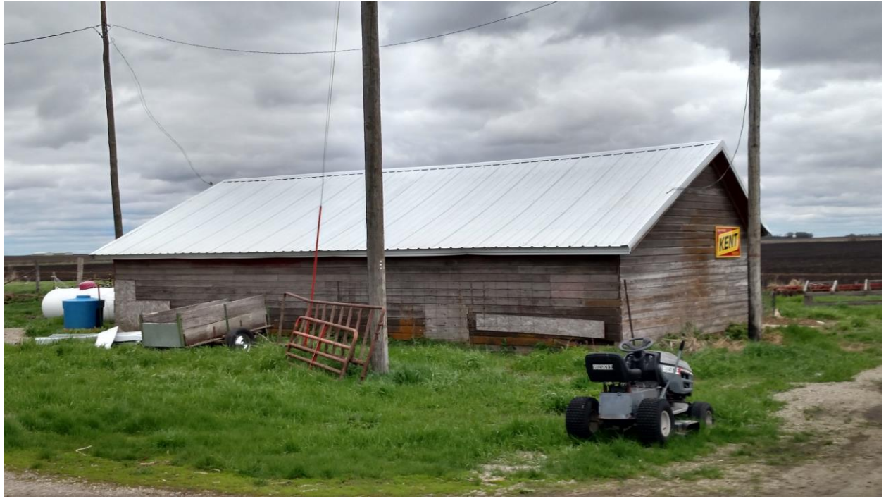
Figure 4 Looking at the central existing farm building