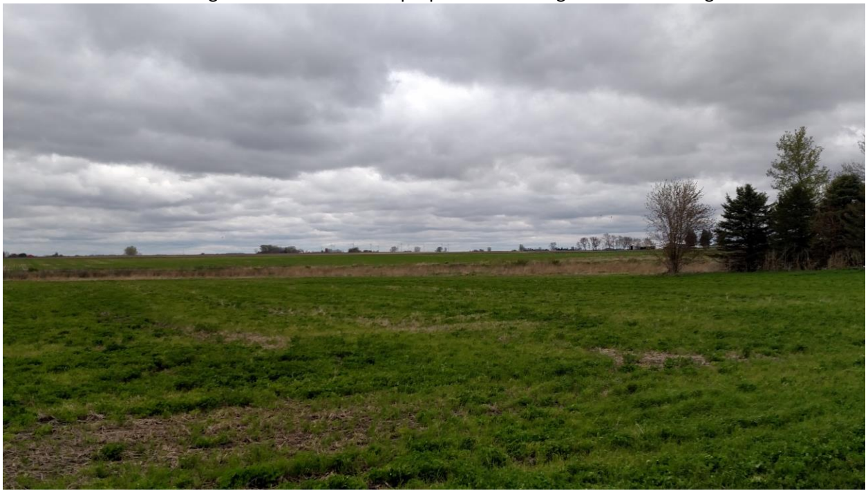
May 9, 2019, J. Robbins

Looking at the location of the proposed second agricultural dwelling