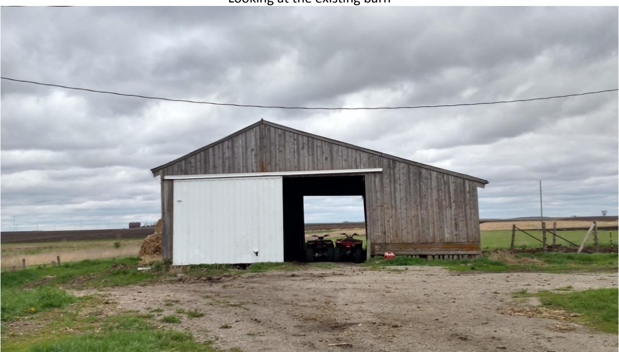
Figure 3 Looking at the existing barn