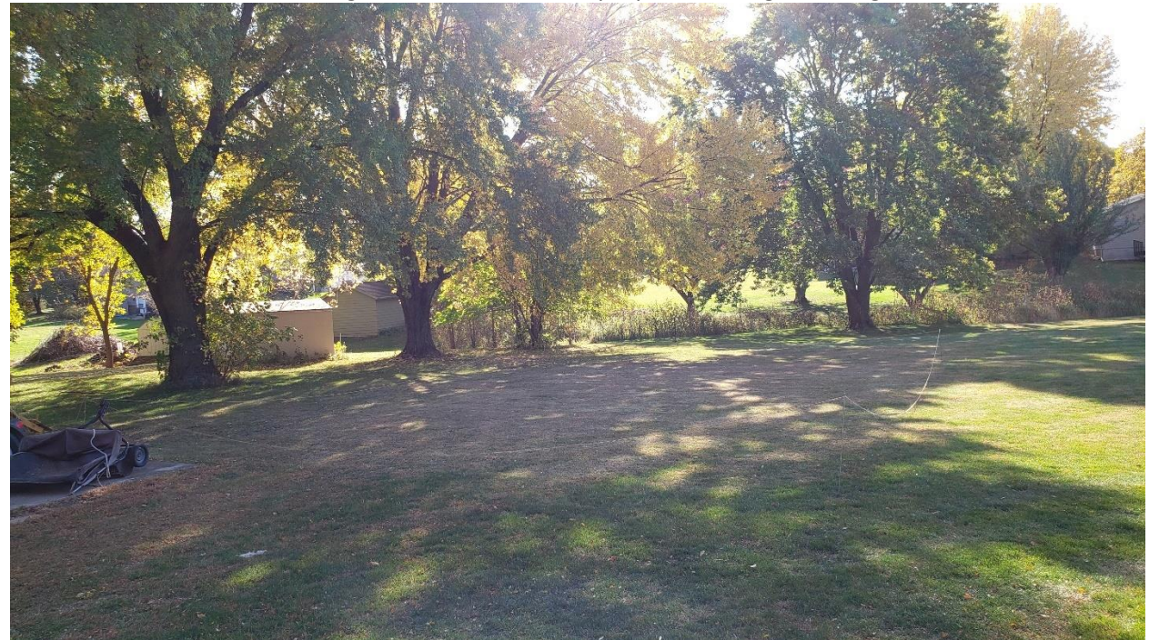
October 8, 2020, J. Robbins

Looking at the location of the proposed storage building