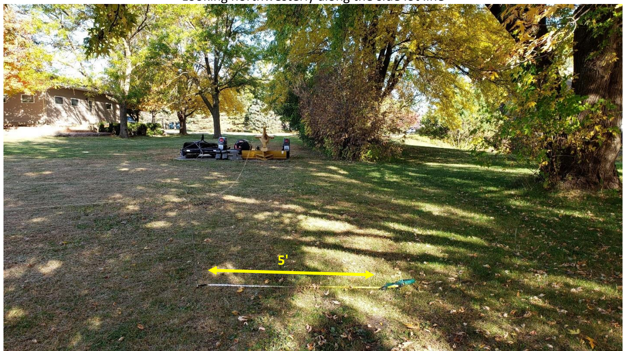
Figure 3 Looking northwesterly along the side lot line