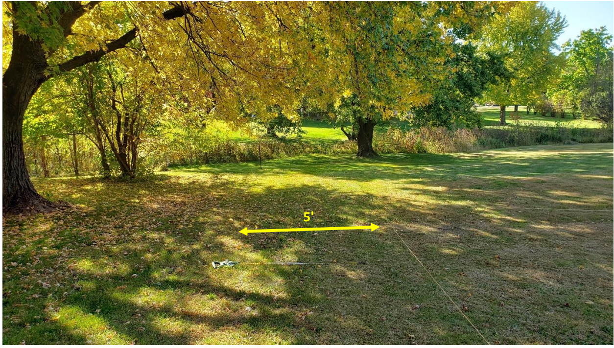
Figure 2 Looking southeasterly along the side lot line