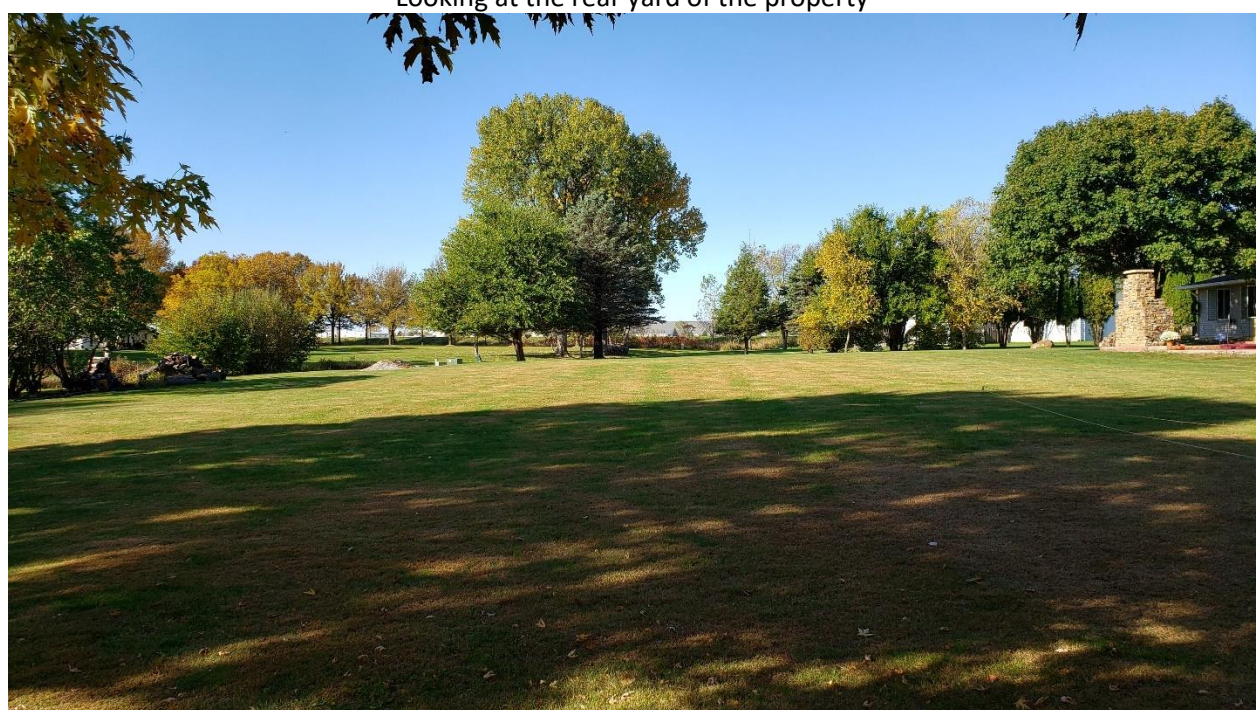
Figure 5 Looking at the rear yard of the property