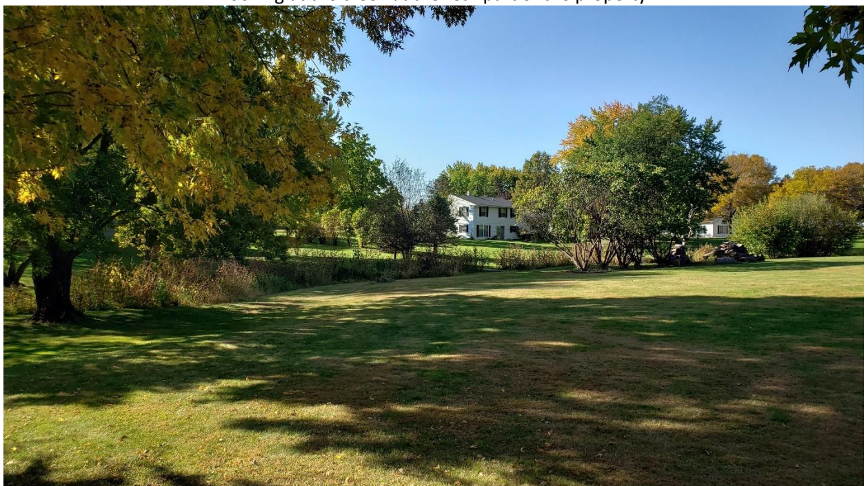
Figure 4 Looking at the creek at the rear part of the property