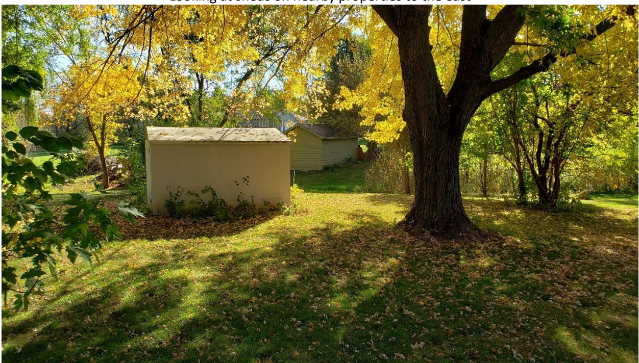
Figure 6 Looking at sheds on nearby properties to the east