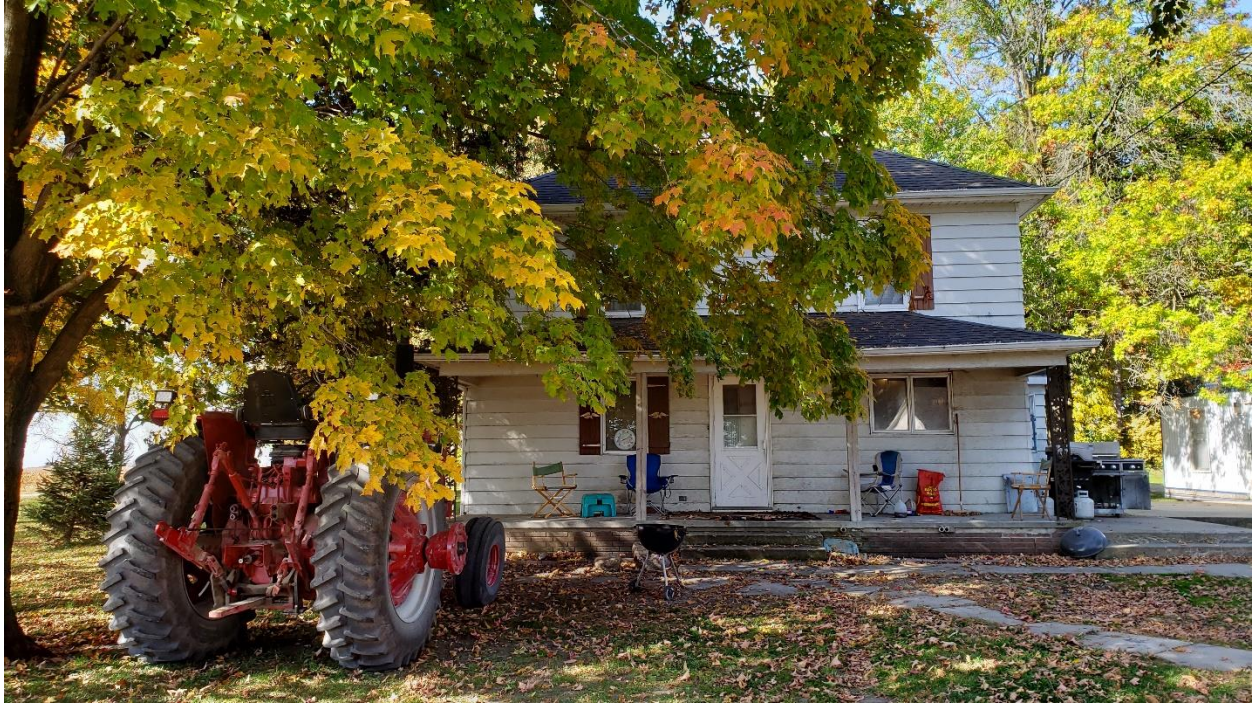
October 8, 2020