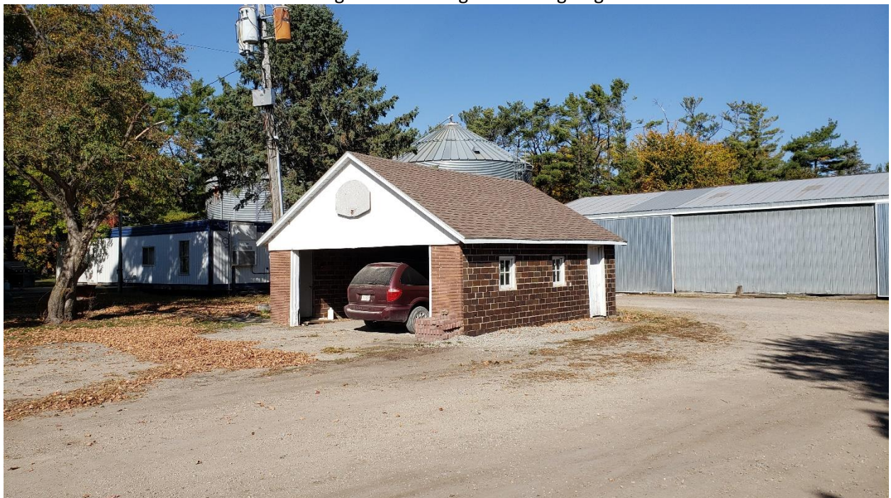
Figure 3 Looking at the existing detached garage