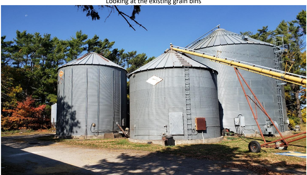
Figure 4 Looking at the existing grain bins