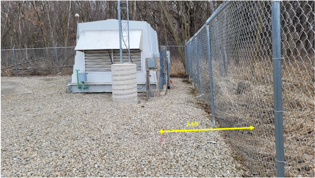
Figure 3 Looking east along the south side lot line