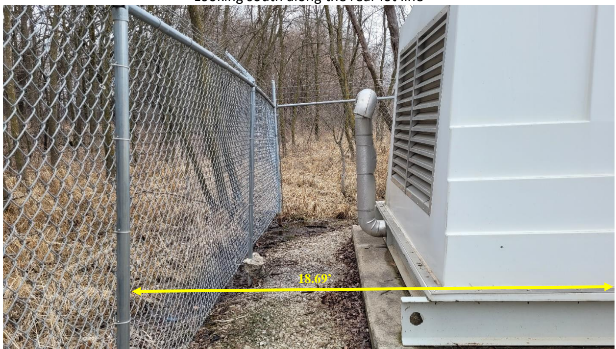
April 5, 2023