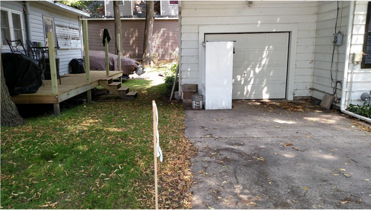
August 8, 2018, J. Robbins

Figure 5 Looking southeast along the shared southeast side lot line at the garage on the adjacent property