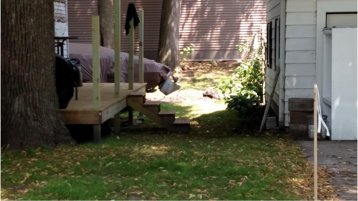
Figure 4 Looking northeast along the southeast side lot line