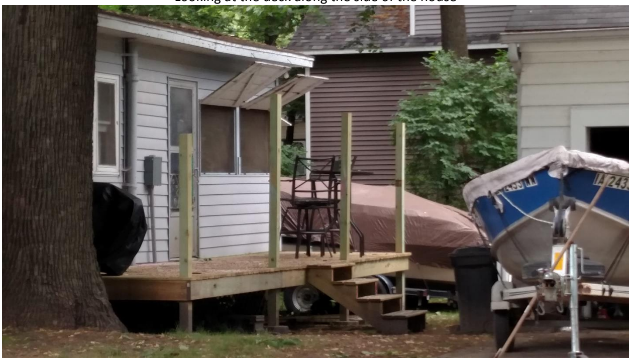
July 13, 2018, J. Robbins

Looking at the deck along the side of the house